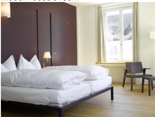
Modern double room